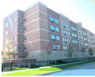
Enola A. Dew Apartments