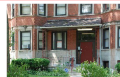
Tabitha House Residential Womens Treatment Facility

One of five newly constructed houses. Four are for persons with disabilities that provide a community based, less restrictive environment for this population. One is for provides services to Williams Decree Consent Class Members.