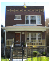
Clara Hope House