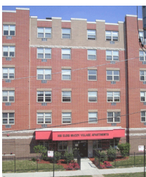
Elois McCoy Village Apartments