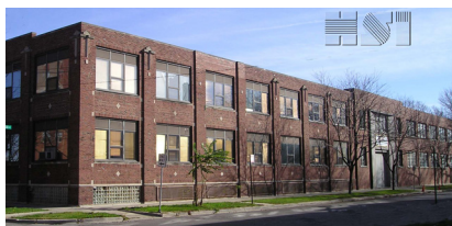
HSI Main Facility

HSI uses a comprehensive multi-tiered approach that engages prevention, intervention, treatment, research, and care management to build healthy communities