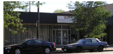
CYS Annex & Veterans Center